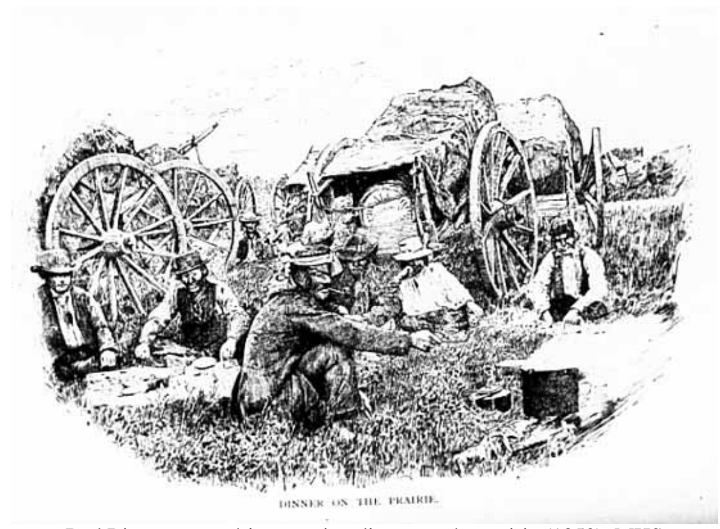
Red River ox cart drivers eating dinner on the prairie (1850). MHS Negative no. 3069