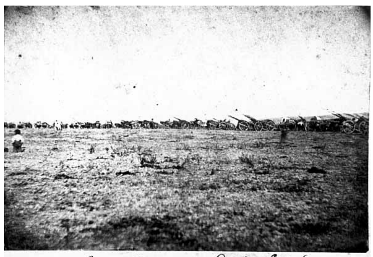
Half Breece Corp new Devits Lake Yokata 1865 Ox carts at half-breed camp near Devil's Lake, Dakota Territory (1865). MHS