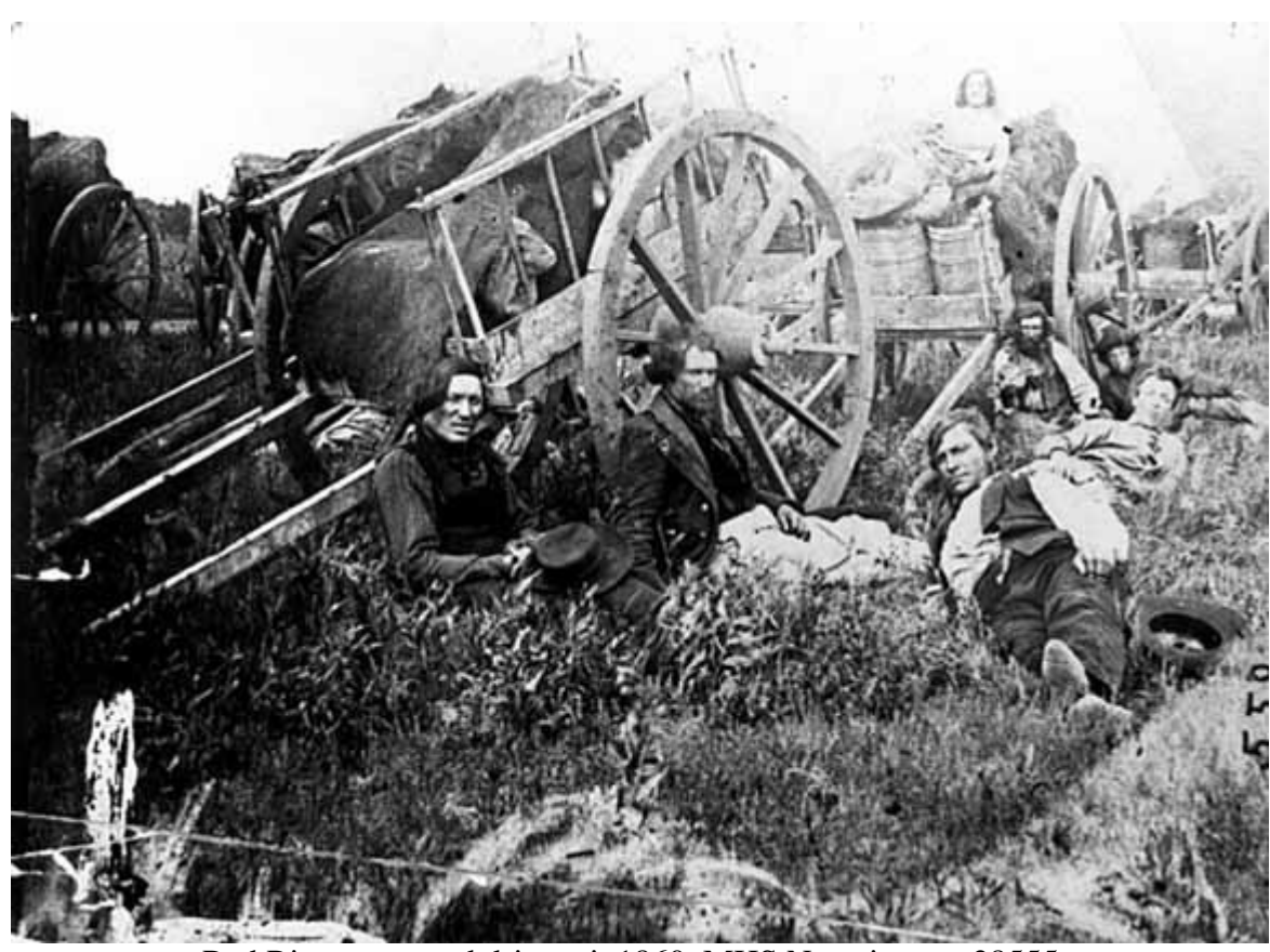
Red River carts and drivers in 1860, MHS Negative no. 28555.