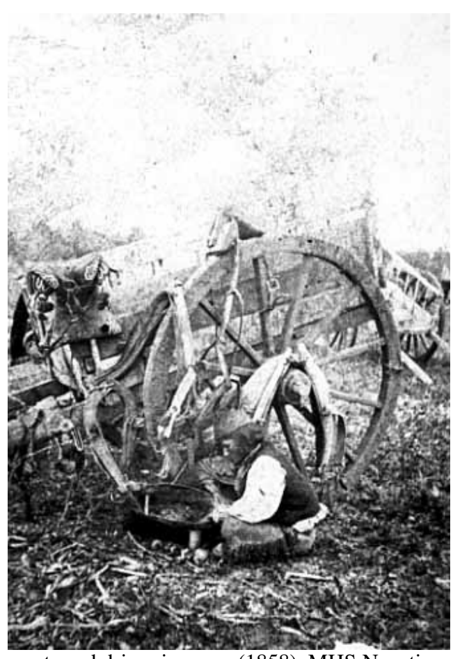
Red River carts and driver in camp (1858). MHS Negative no. 11408