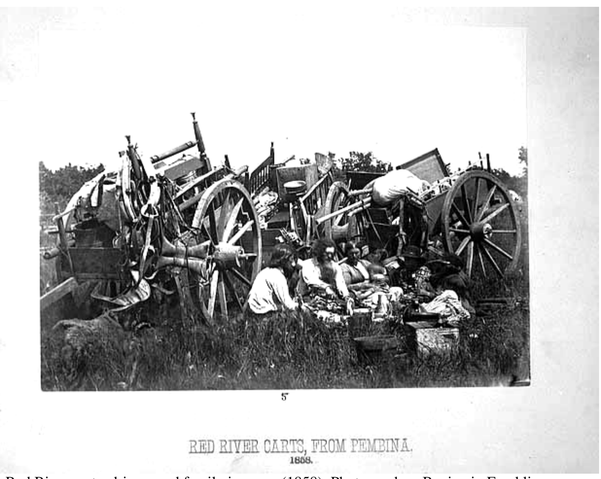
Red River carts, drivers and family in camp (1858). Photographer: Benjamin Franklin Upton. MHS Negative no. 404