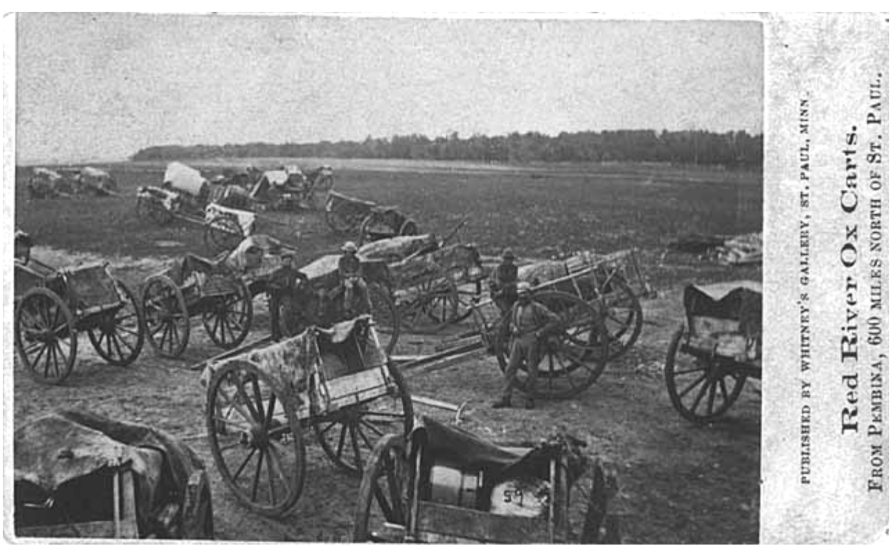
Red River ox carts from Pembina (1860). MHS Negative no. 4587